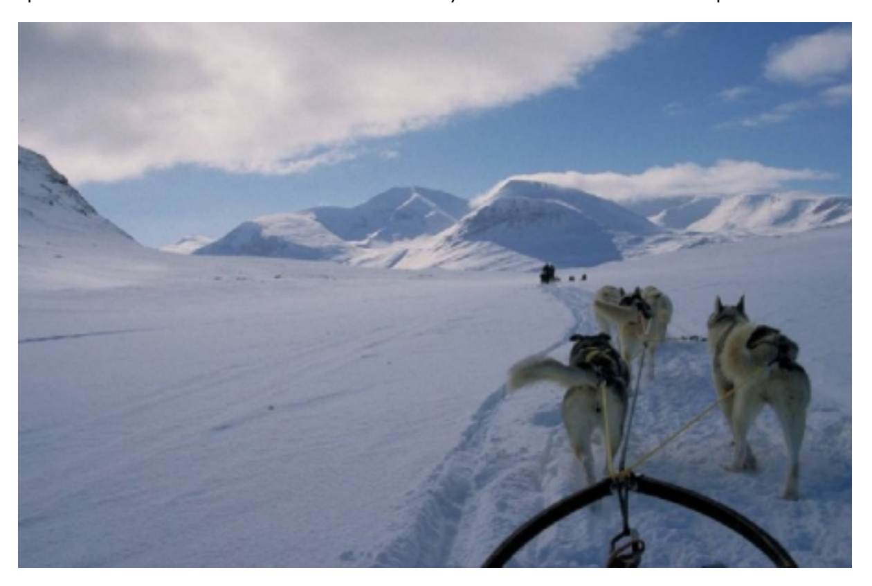
Day 6 Our destination for day six is Singi or Vistas chalets. Today's tour is approximately 26 km. We will spend our last night in the mountains here.

The famous Kungsleden (The King's Trail) starts in Abisko, and this is the route we will be following for the next few days. Our destination for today will be Sälka or Allesjaure a spot well known for its immense natural beauty. This is 30 km with a few uphill sections.